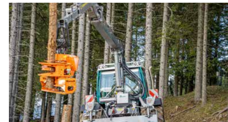
Versatile mounting options.

Technical data and illustrations are not binding. Subject to changes for reasons of further development.