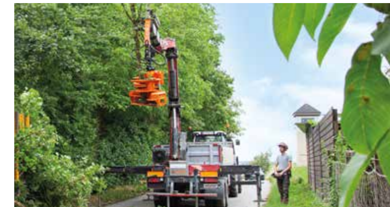
Practical wireless control.