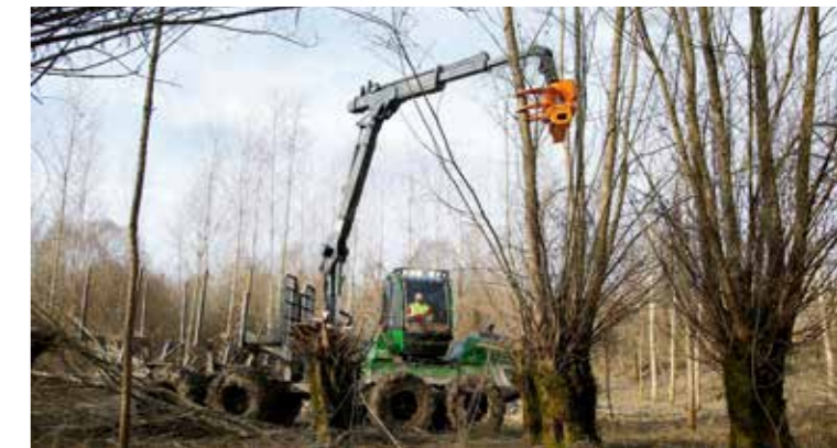
Highly rugged and durable grapple saw.