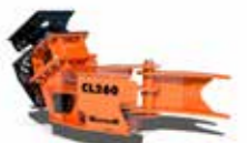
Woodcracker CL260 + Swivel unit