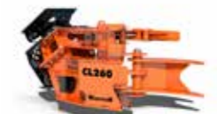
Woodcracker CL260 + Accumulator + Swivel unit