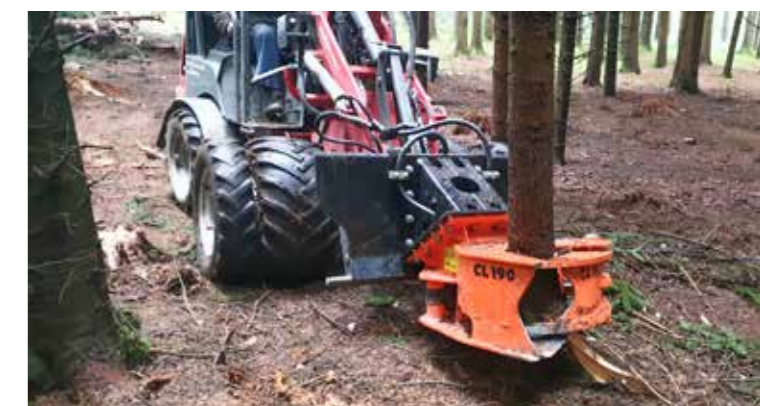
Woodcracker® CL190 cuts weak wood up to 25 cm.