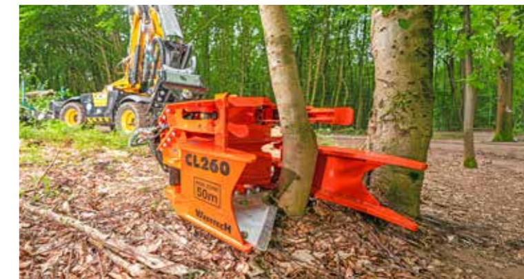
Optional available with accumulator.