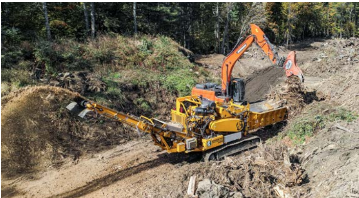
Chipping of the harvested material.