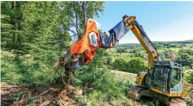
Careful removal of the entire rootstock from the ground.