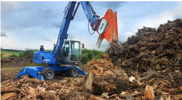
Used for clearing the soil.