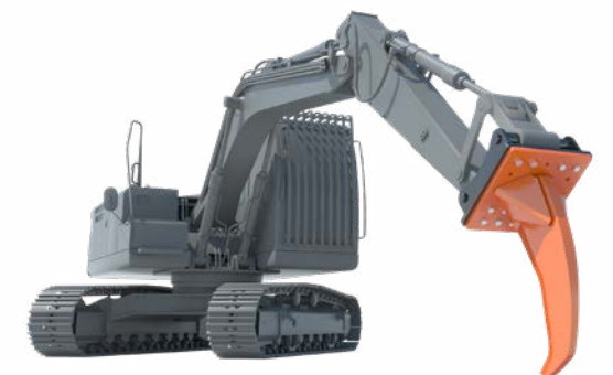
Woodcracker® Ripper Tooth