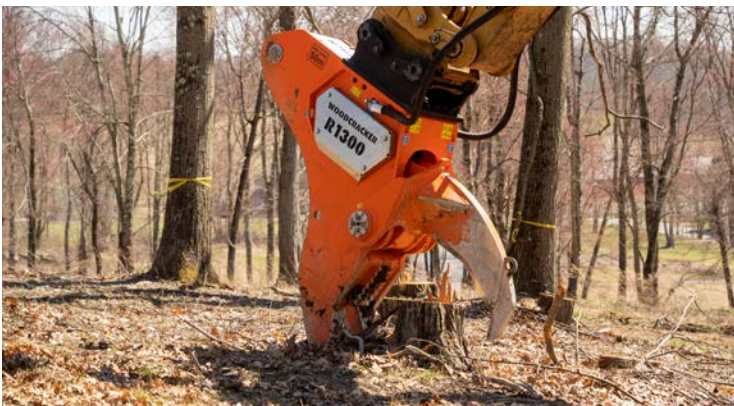
Robust cutting unit.