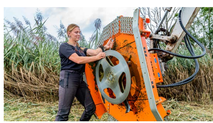
Easily replaced knifes, replaceable attrition skids.