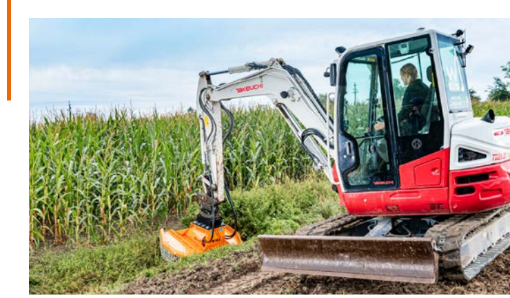
Mulcher at slope maintenance.