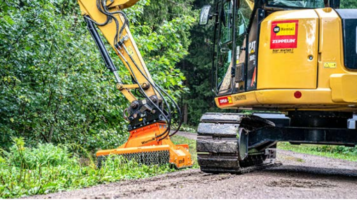
Mulching in both directions possible - very efficient working method