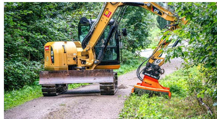
For keeping forest roads clear.