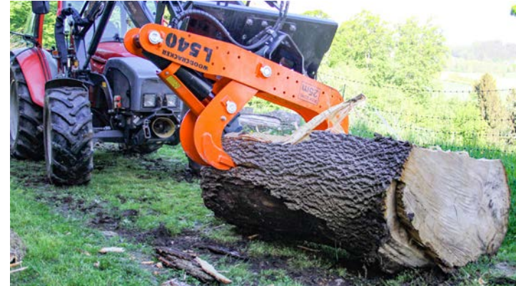
Various mounting options.