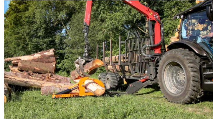
Low effort for splitting.