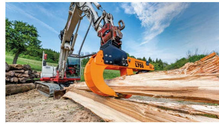
The trunk can be split and loaded in one work step.