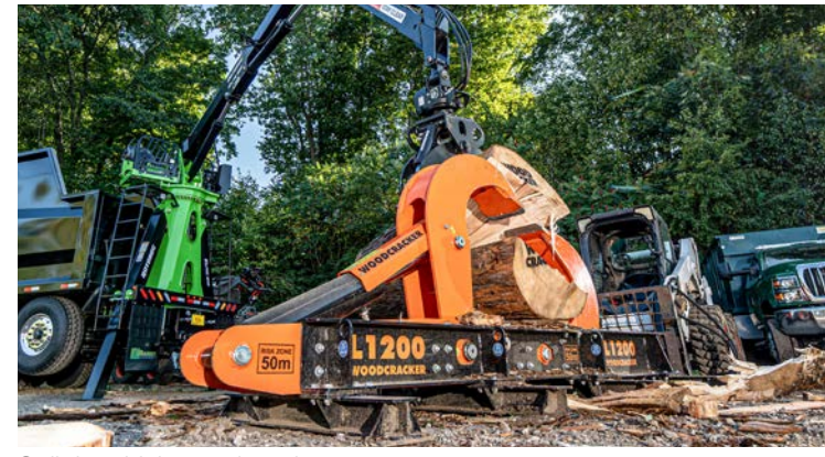
Splitting thick wood trunks.