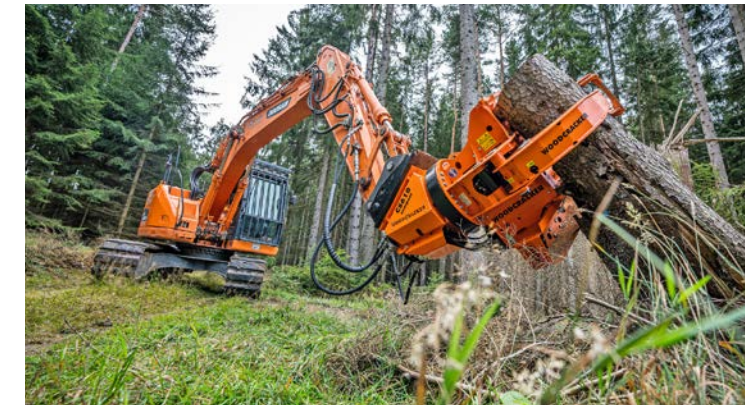
Rapid chopping and piling.