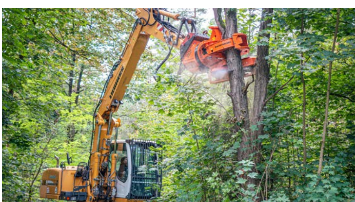
Maintenance work along traffic roads.