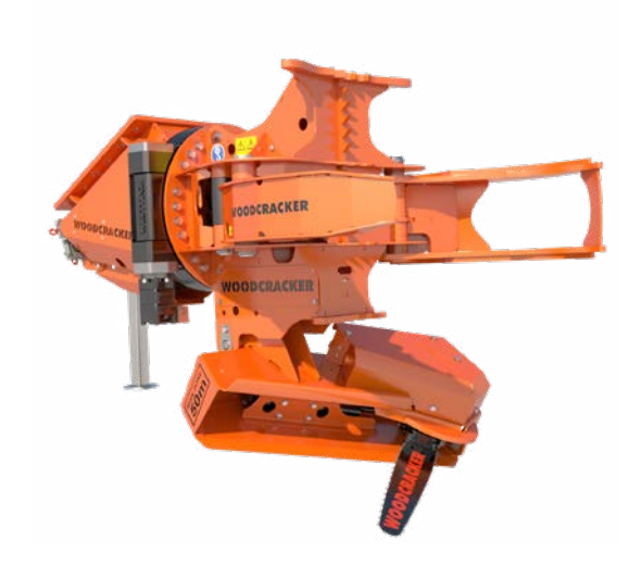
saw unit has a swinging chassis with active suspension