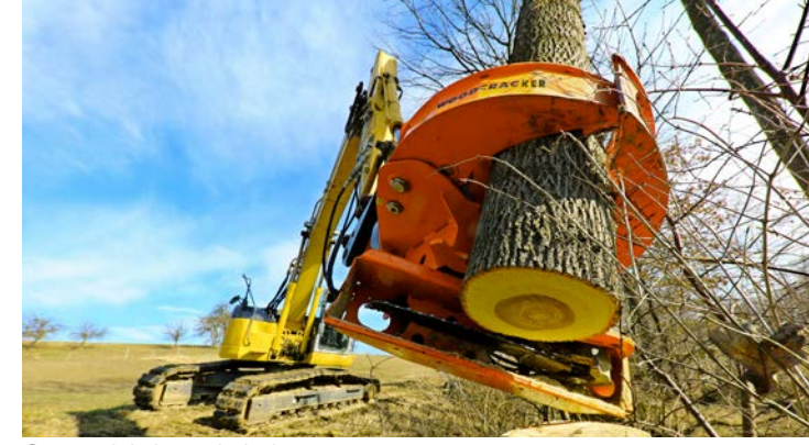
Grease lubricated chain