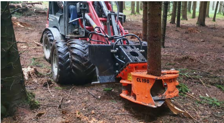
Woodcracker® CL cuts weak wood up to 40 cm.