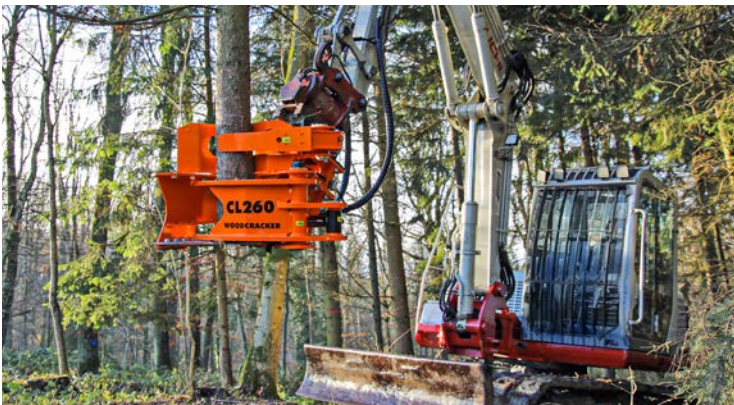
Optional available with accumulator.