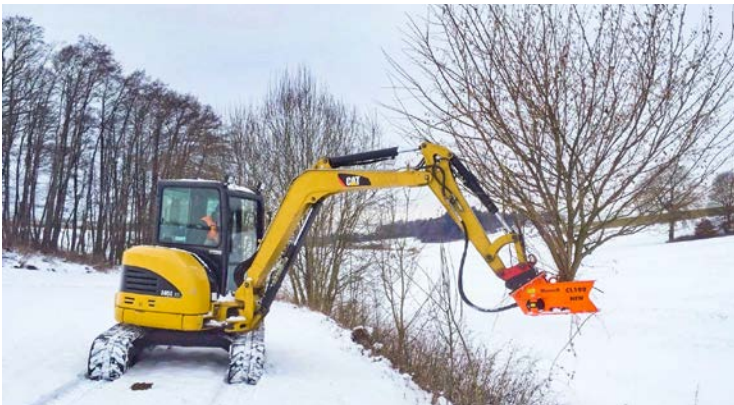
For mini excavators from 2,5t.