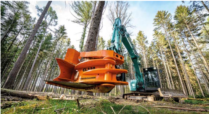
Fast harvest of small trees and bushes.