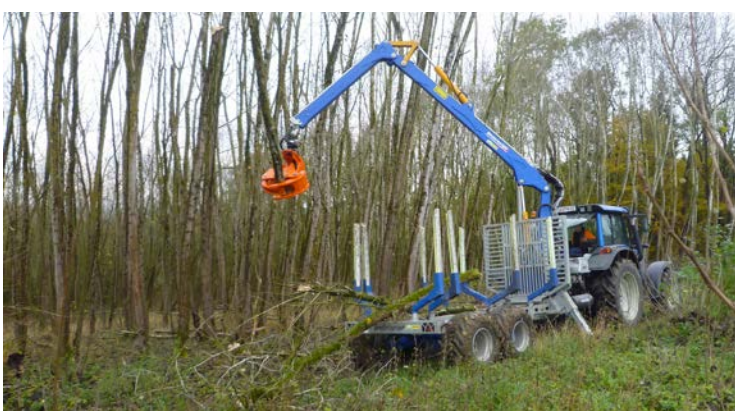
Suitable for forest crane attachment.