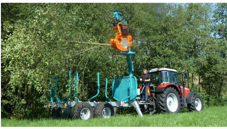
Fast harvest of small trees and bushes.