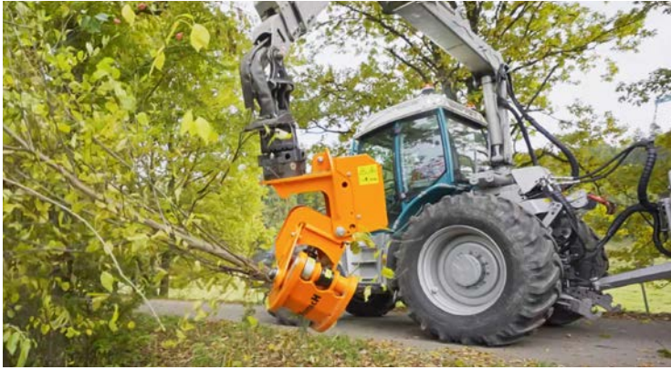
Harvest of short rotation coppice.