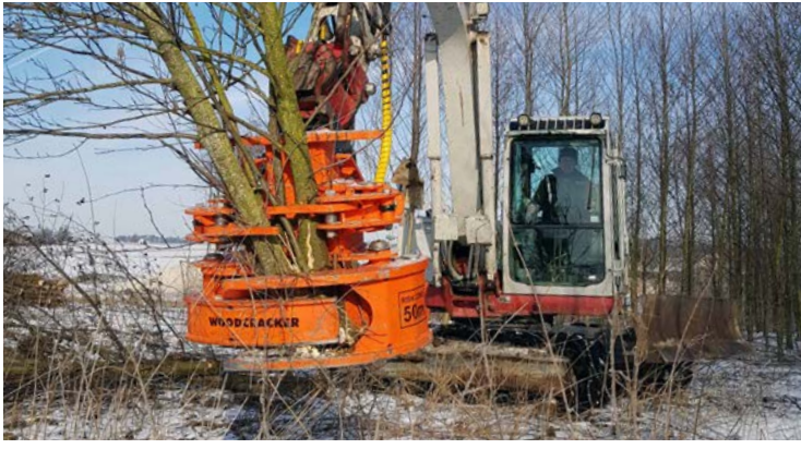
Optional with accumulator.