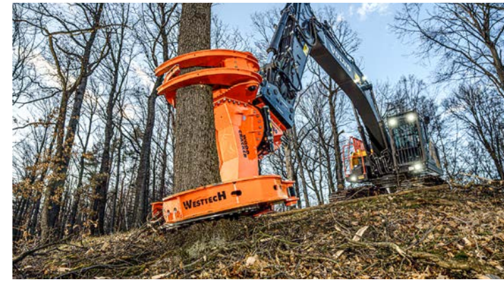
Tree care along traffic routes.