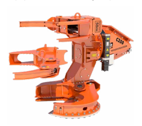
optional: Accumulator (QC)