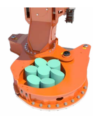
high cutting capacity