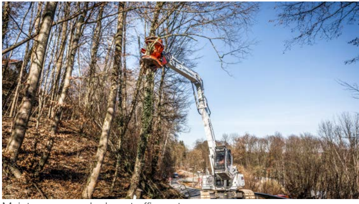
Maintenance work along traffic routes